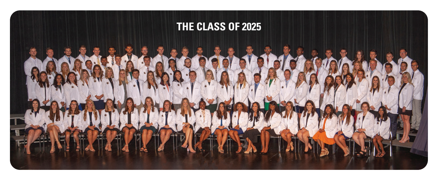
2,552 Applicants 100 Students enrolled (54 women, 46 men) 23 Average Age 3.64 Overall GPA 3.55 Science GPA From 42 different undergraduate institutions

Alabama, Arizona, California, Florida, Idaho, Illinois, Indiana, Louisiana, Michigan, Minnesota, Montana, Ohio, Rhode Island, Virginia, Wisconsin — Canada, Guam, Puerto Rico, Vietnam