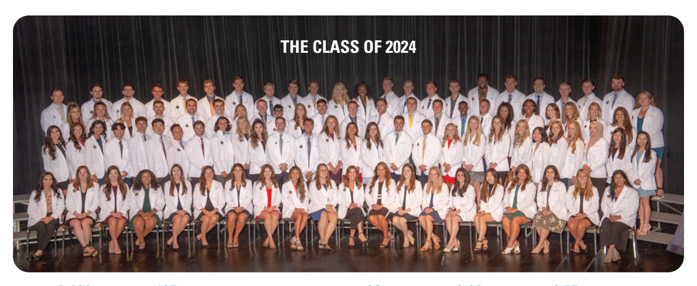
2,439 Applicants 107 Students enrolled (56 women, 51 men) 23 Average Age 3.66 Overall GPA 3.57 Science GPA From 48 different undergraduate institutions