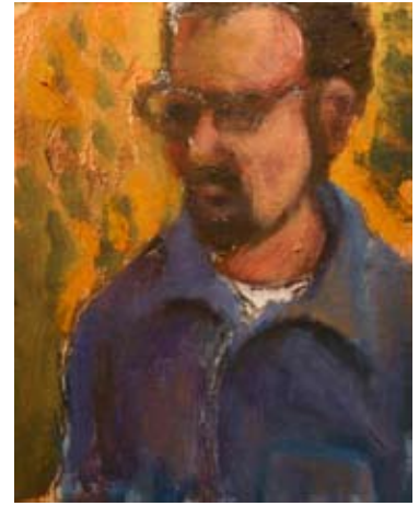
Peter Carlson, Grad Student , 2007 Oil on cardboard 5 x 5 in.

The gift bar soaps now on display, a product of Beulah Bay Essentials, are fragrant specialty soaps cast in molds representing goats, pigs, sheep, cows, roosters and horses. The scents range from rose to lilac to lemongrass. In addition to a new line of Jewelry, the Shop continues to carry a complete list of Haggerty Museum exhibition catalogues, totebags and cards.