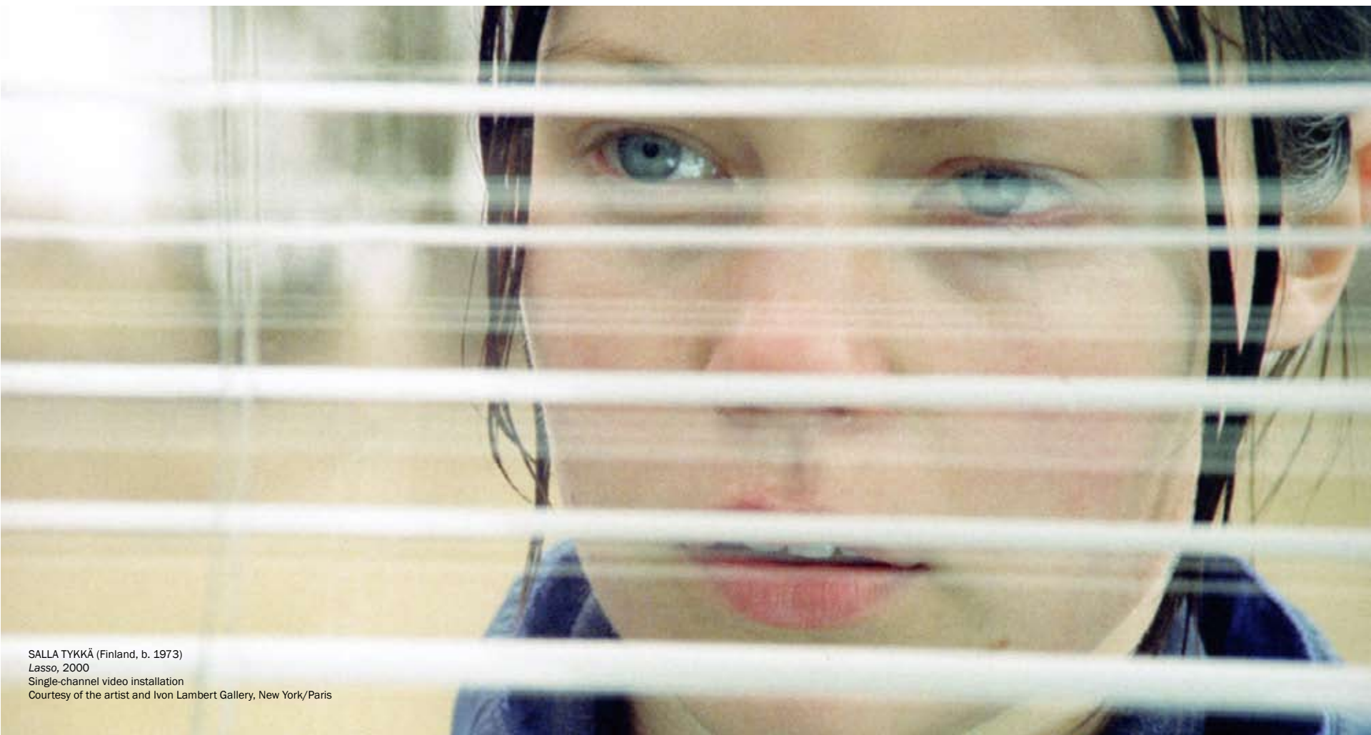
SALLA TYKKÄ (Finland, b. 1973) Lasso , 2000 Single-channel video installation Courtesy of the artist and Ivon Lambert Gallery, New York/Paris

Monday – Saturday – 10 to 4:30 Thursday – 10 to 8. Sunday – noon to 5