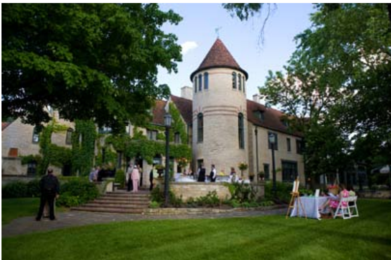
Spring Event guests gather on the back veranda of the Manor House.