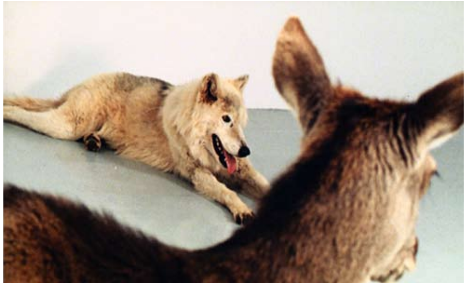
MIRCEA CANTOR (Romania, b. 1977) Deeparture , 2005 Single-channel video installation 2 min. 3 sec.

The opening reception and lecture by Andrea Inselmann will take place on October 30 at 6 p.m.