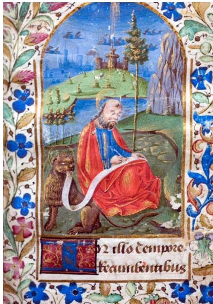
Book of Hours (detail) French, 1460-80 Ink, gold leaf, tempera on parchment, modern binding 4 3/4 x 3 1/2 x 1 1/2"

Noon to 1 p.m., Haggerty Museum of Art Beginning Wednesday, September 3 see calendar, page 4 for details