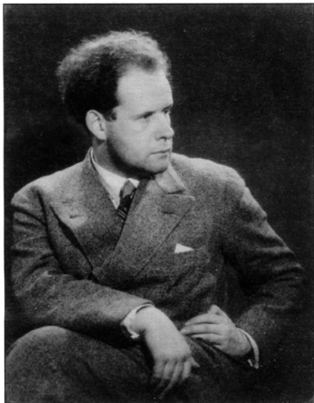
Man Ray, Portrait of Sergei Eisenstein , ca. 1930 Gelatin silver print, 9 1/2 x 7 in., Museum purchase, 98.25

Works by Man Ray were last exhibited at the Museum in 1994. The exhibition closes on Sunday, May 26.