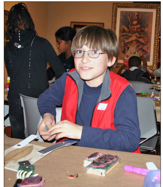
Students from MacDowell Montessori School working on Lam-inspired Spirit Creatures .