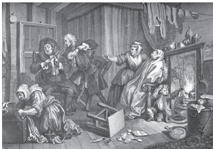
William Hogarth, A Harlot's Progress, Plate 5 , Moll dying of syphilis, 1732, etching, anonymous gift