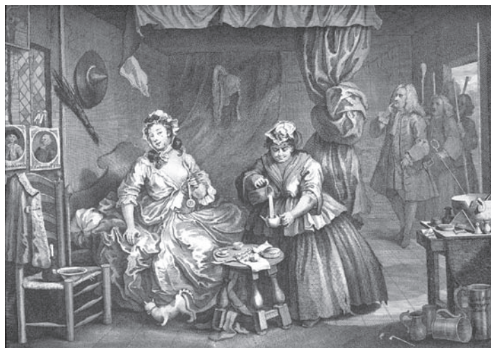
William Hogarth, A Harlot's Progress, Plate 3 , Moll has gone from kept woman to common prostitute, 1732, etching, anonymous gift