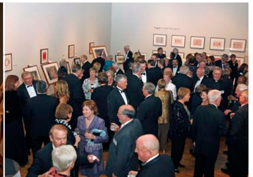
Social hour was held in the museum galleries