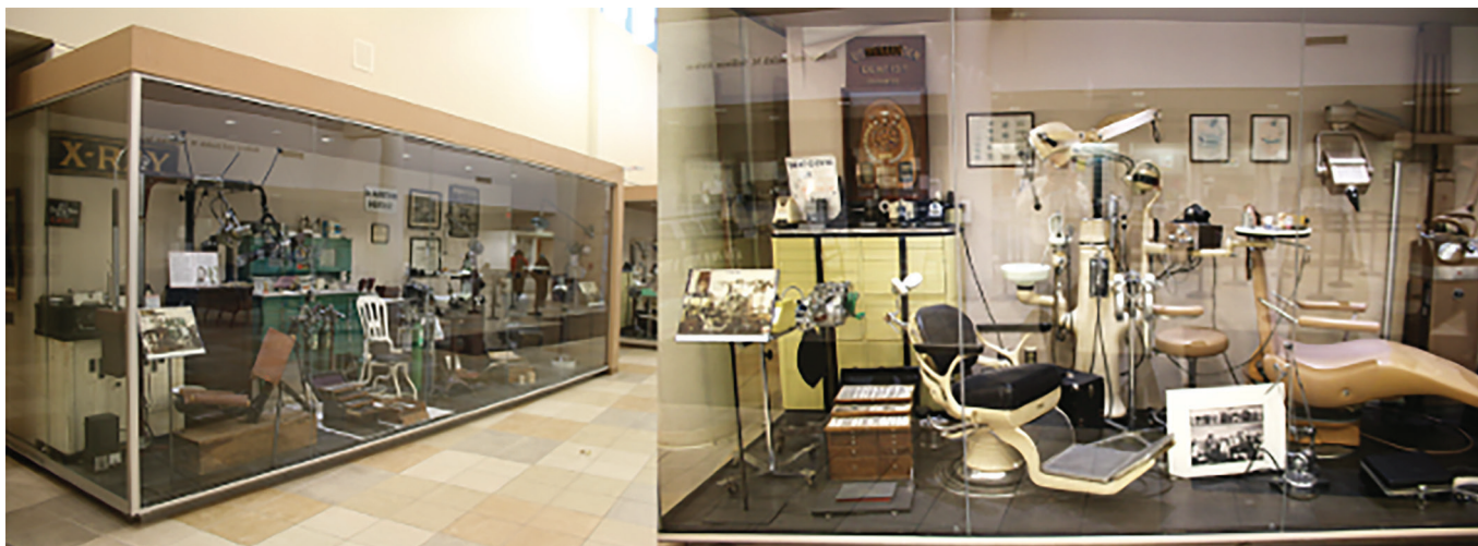
Figure 9: Some images of the artifacts in Museum Showcases at MUSOD (Courtesy of Dr. Mark Mandel).