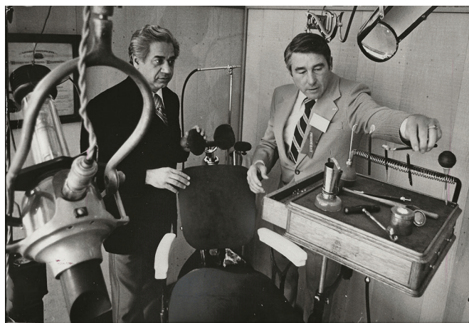
Figure 7: Exploring the riches of our history in museum artifacts.