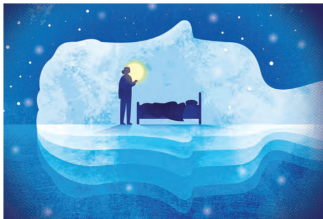
A $2.38 million grant will fund research on the link between chronic sleep restriction and bone loss.

• Biomaterials and Tissue Engineering. It's estimated that 50%-75% of a dentist's time is spent with the biomaterials that they use for patient care. Biomaterials research at MUSoD has focused on characterization of material properties, fabrication of new biomaterials, characterization of the host response to biomaterials (biocompatibility), and improving adhesion to tooth structure by modification of adhesive resins. Many of our clinical graduate programs also perform research on dental biomaterials used in endodontics, orthodontics, prosthodontics and periodontics. MUSoD has tissue engineering research that seeks to repair hard- and