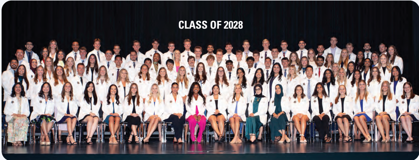
White Coat Ceremony Marquette University School of Dentistry Incoming Class of 2028