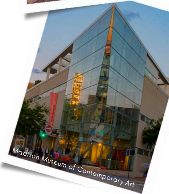
Madison Museum of Contemporary Art

LEARN MORE AND CHART YOUR JOURNEY AT WWW.WISCONSINARTDESTINATIONS.COM .