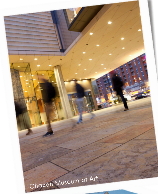
Chazen Museum of Art

Cap off your evening – and your trip – with a well-deserved Wisconsin Old Fashioned at (where else?) The Old Fashioned . Cheers!