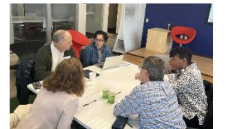
Photo: Department leadership discussing best practices for equitable teaching workloads