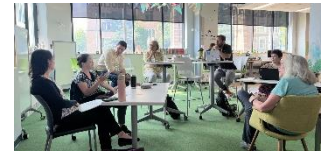
Photo: ADVANCE IT Planning Team discussing potential research projects