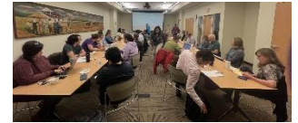
Photo: Faculty gathering in Zilber Hall to discuss future ADVANCE grant ideas