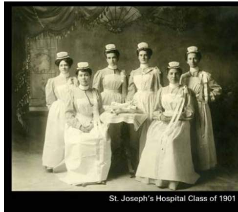
St. Joseph's Hospital Class of 1901

Our history begins with an affiliated school and precursor to the Marquette University College of Nursing (MUCN): the St. Joseph's Hospital Training School for Nurses. Class portraits from St. Joseph's from 1901, 1908, 1915, and 1930 accompany a variety of historical nursing garments and catalogue the changing uniforms from the early 20 th century.