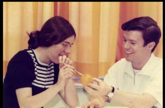
Students practice the administration of shots by using an orange, 1973