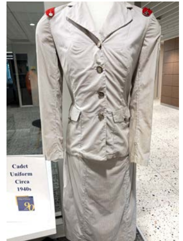
Cadet Uniform Circa 1940s