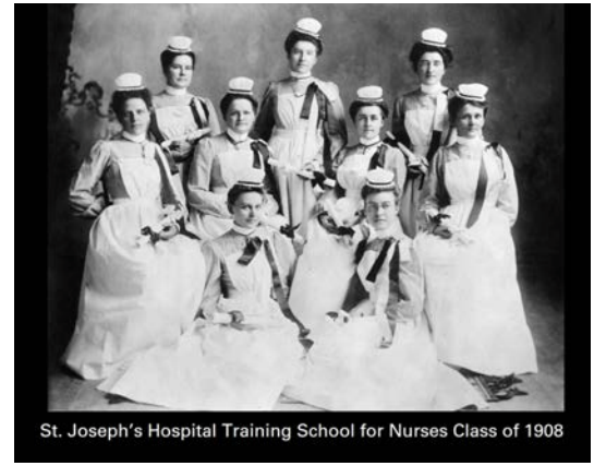
St. Joseph's Hospital Training School for Nurses Class of 1908