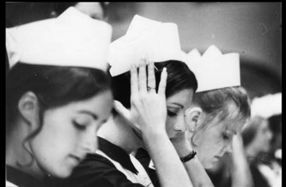
A nursing student adjusts her cap, 1972-1973