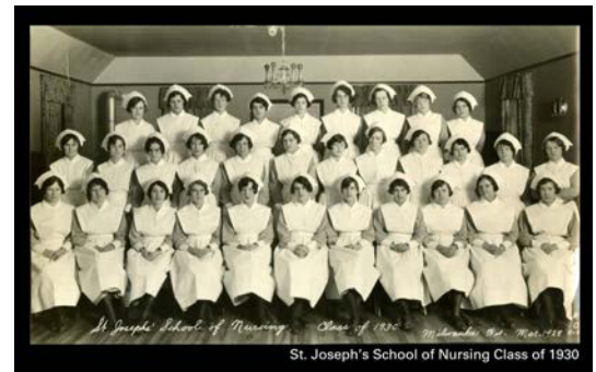
St. Joseph's School of Nursing Class of 1930