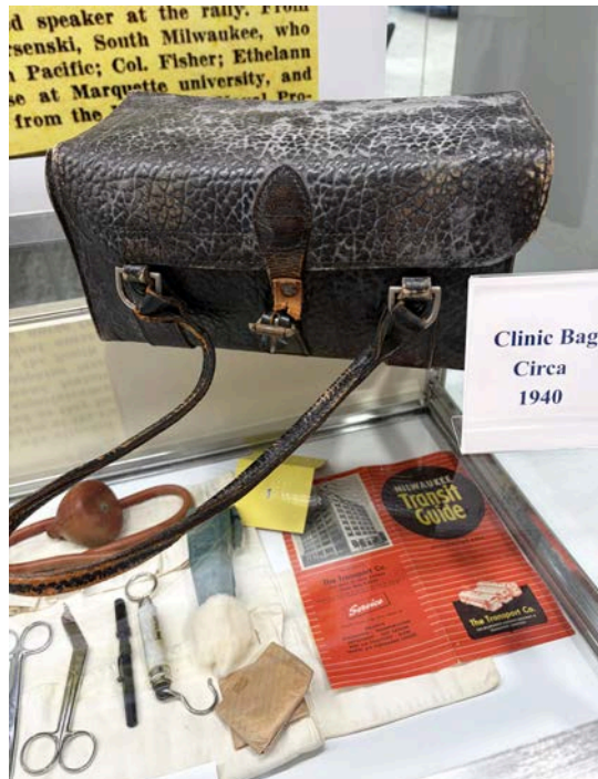
Clinic Bag Circa 1940

The military nurse experience encompasses those called to serve patients, communities and their country. Marquette has a proud history of nurses who serve—from the accelerated nursing program begun at Marquette in 1943 (preparing cadet nurses during World War II) to the ROTC nursing students of today. This exhibit features a 1940s cadet nurse uniform alongside a 1940s clinic bag and a 1978 navy nurse uniform.