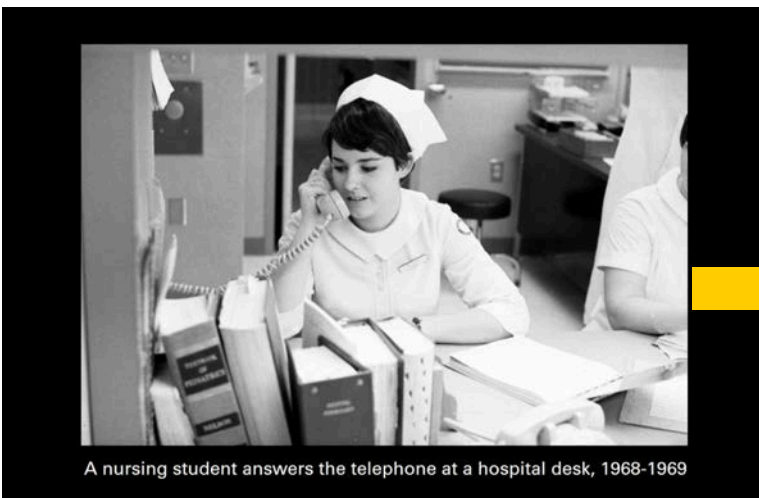
A nursing student answers the telephone at a hospital desk, 1968-1969

The lamp used as part of this 1961 capping ceremony (above), harkens back to the earliest days of the nursing profession of Florence Nightingale who carried a lamp in military hospital wards during the Crimean War.