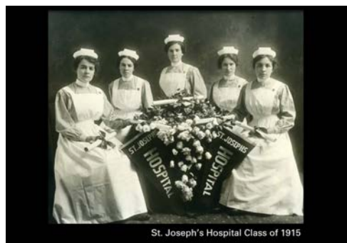
St. Joseph's Hospital Class of 1915